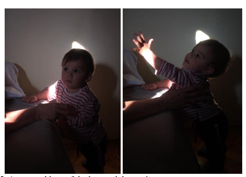
Figures 1 and 2. An assemblage of the boy and the environment.

As soon as he woke up in a darkened room, a boy (11 months) looked in astonishment in the direction of the window. The curtain was drawn, and only a thin ray of light could break through it, illuminating the opposite wall. Staring in the direction of the light, the boy seemed like he was looking at something I could not see. It was as if only he knew what he saw and he liked that very much. When I took a closer look, I saw that tiny dust particles flew around the room and floated carelessly in that ray of light. He looked at them and then at the light on the wall. I started moving my hands to make shadows on the opposite wall. My improvisation changed the boy's attention; therefore, he turned quickly to the lighted wall and tried to touch the shadows. After trying to touch it, he returned to the light source and reached for it, as if he was trying to imitate me, or maybe to grab flying dust particles...<sup>18</sup>.