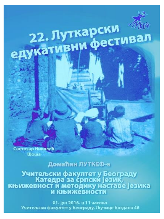
Picture 3. The poster of XXII Festival of Puppetry in Education (LUTKEF).