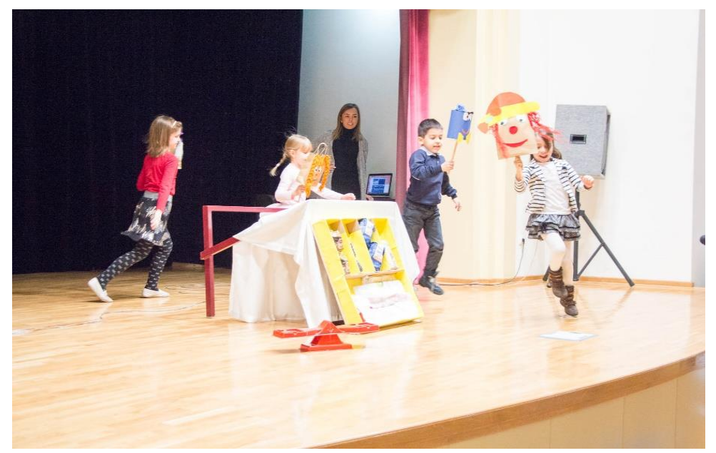
Picture 9. Math performance of pre-schoolers at The Festival of Puppetry in Education (LUTKEF).

LUTKEF also pays attention to the full inclusion of children with special needs. They, too, have received the main rewards and were selected for television series (Milovanović, 1997). Various attempts to establish the influence of a systematic and professional utilization of puppet theatre art in the development of speech and literacy development of children with hearing impairment have proved to be successful, too. The performances in which puppets helped in the learning of a foreign language have found their place at LUTKEF, too.