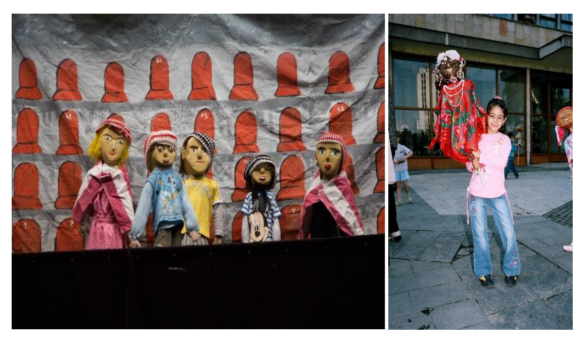
Pictures 7-8. The Puppetry in Education Festival (LUTKEF).

It is important to point out that, in a situation where true critical tones are rarely heard in the professional children's drama theatre of Serbia, the strongest social criticism comes from a puppet theatre at a small puppet festival. Secondly, LUTKEF promotes plays based on the application of puppet theatre art in the processes of young people's forming and adopting patriotic attitudes, values and behaviours; assimilating knowledge about the Serbian culture, history and tradition; moulding a positive attitude towards them and a continuous interest in their spiritual values; cultivating the feeling of national self-consciousness and cherishing the deepest love for their own country.