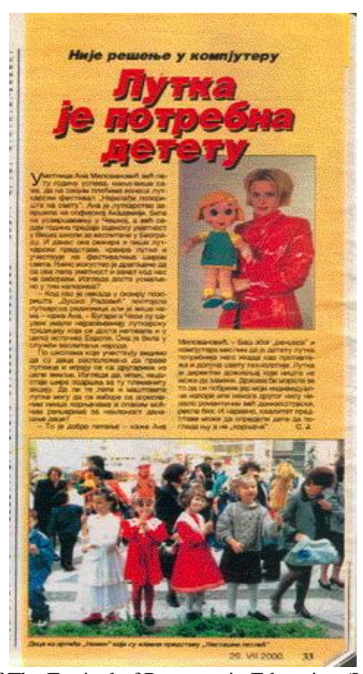
Picture 10. Press clipping of The Festival of Puppetry in Education (LUTKEF).

The festival has significantly contributed to the wider media and professional affirmation of both puppetry in education and the best contributors of LUTKEF.